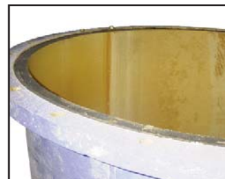
Polyisoprene lined casing - after use