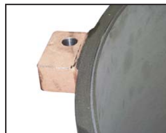
Polyisoprene lined casing - before use